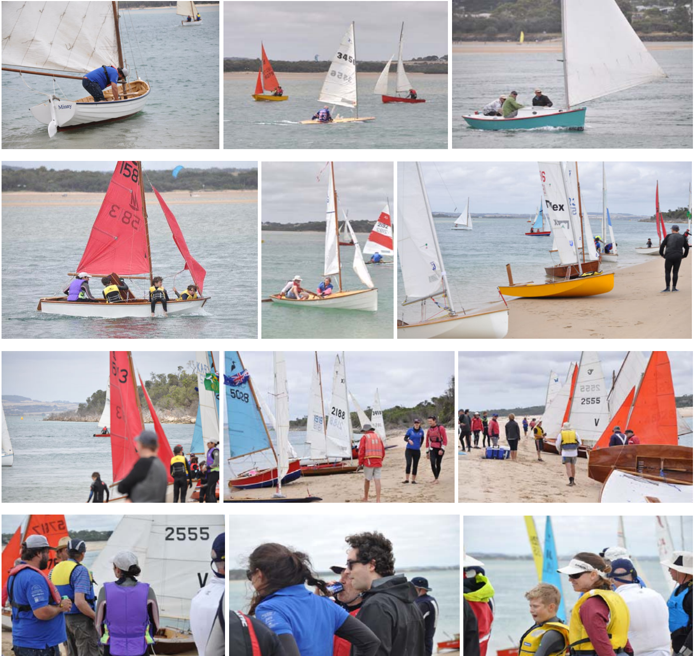
Sailors with classic wooden dinghies signing on for the Social Sail went into a draw for prizes.

On Thursday afternoon sailors launched their dinghies at the yacht club and sailed with family and friends up Anderson Inlet to view the scenery landing on Point Smyth to have a snack and dink. The social sail draw also took place.